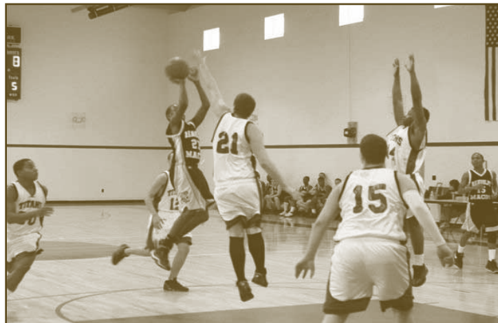
A Timber Ridge School basketball player contesting a jump shot versus Randolph Macon Academy.