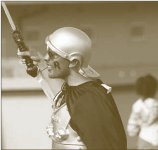
The Timber Ridge School mascot showing his Titan pride as he gets the crowd energized during a home football game. The 2008 football team had a successful 5-2 season.

Please visit our website for updates and/or schedule changes. | www.timber-ridge-school.org