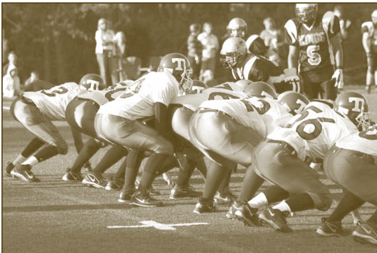
Members of the Timber Ridge School offensive line versus the Fairfax Kings home school team.