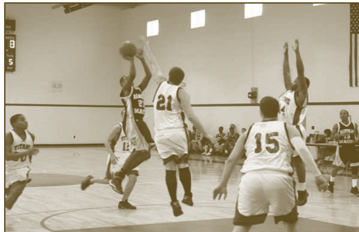
A Timber Ridge School basketball player contesting a jump shot versus Randolph Macon Academy.