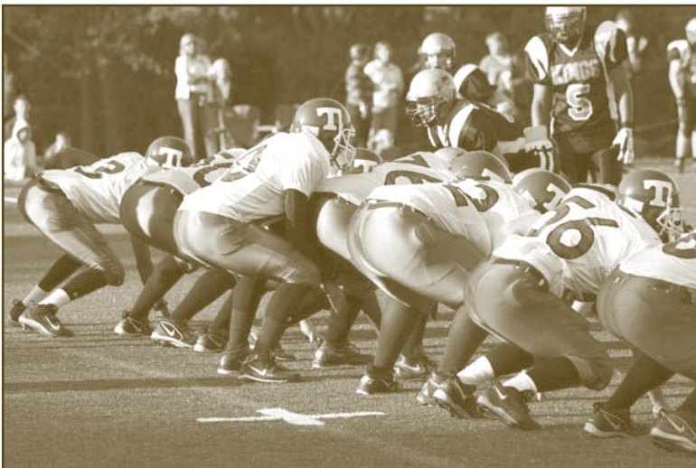
Members of the Timber Ridge School offensive line versus the Fairfax Kings home school team.