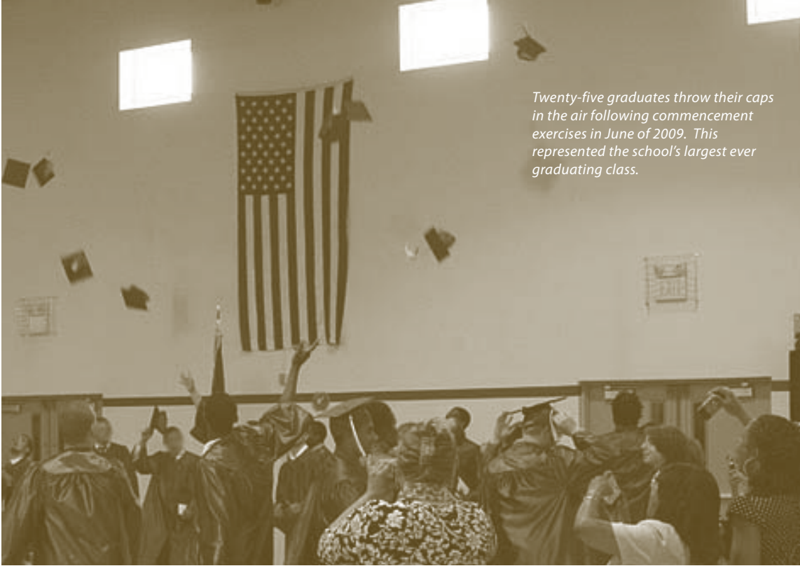
Twenty-five graduates throw their caps in the air following commencement exercises in June of 2009. This represented the school's largest ever graduating class.