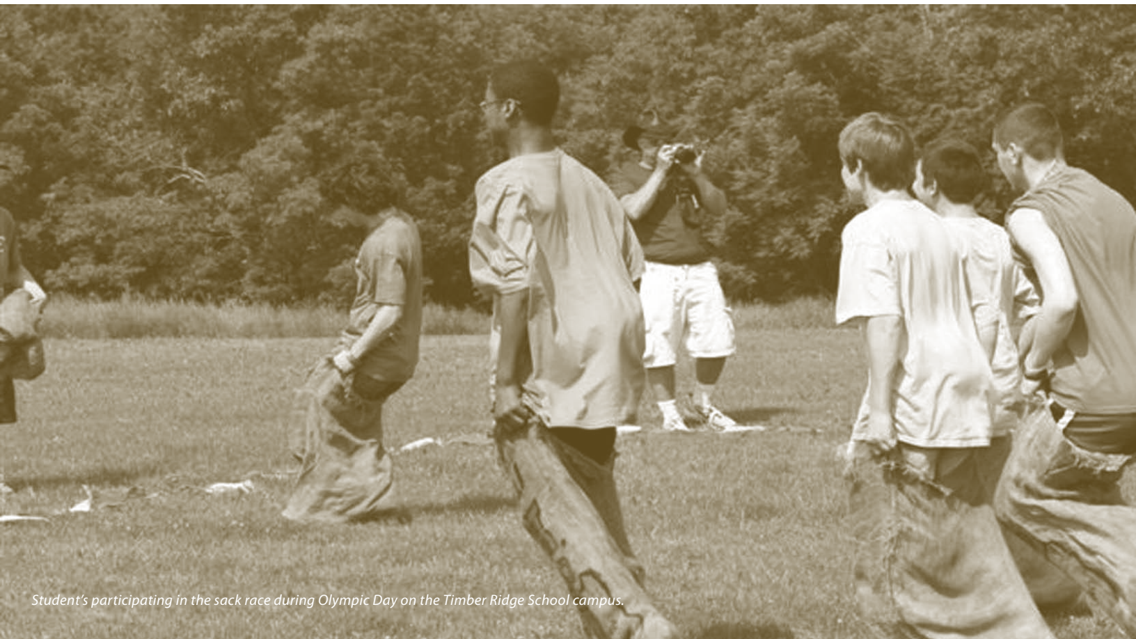
Student's participating in the sack race during Olympic Day on the Timber Ridge School campus.

As the Timber Ridge School staff continues their valuable work in assisting each student, please know your continued support, regardless of the size of your gift, is vital to the successful mission of our School. The 24 hour, 365 day a year care we provide is a very much needed educational opportunity for a distinct population of young people. We are thankful to our family of friends who, through their contributions, allow us to provide this valuable service. Your continued support and investment in our students' futures is appreciated.